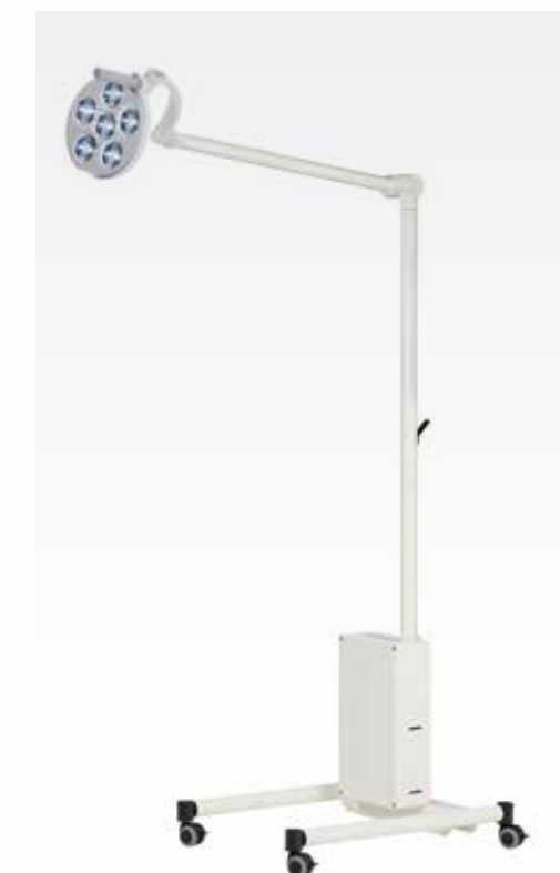
TRIANGO 60 F Battery