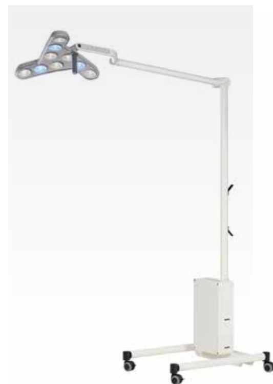
TRIANGO 100 F Battery

The Derungs UPSmed Pack has a safety system that monitors the battery status. When the charge level is low (from approx. 50% charge capacity), acoustic signals are sounded to draw attention to the situation in good time.