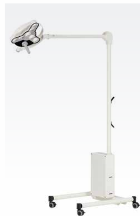
TRIANGO 80 F Battery